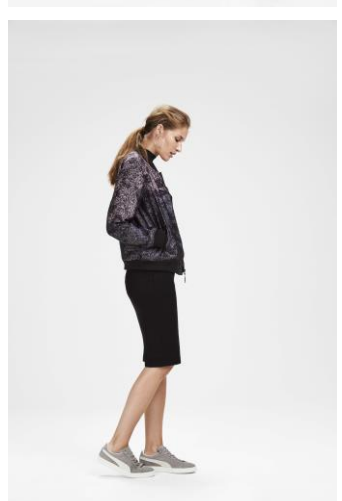
KappAhl was founded in 1953 in Gothenburg and is a leading fashion chain in the Nordic region, with nearly 380 stores in Sweden, Norway, Finland and Poland, together with Shop Online. Our business concept is to offer value-for-money fashion of our own design to women in the prime of life and their families. Roughly 38% of the range is sustainability-labelled.

In 2014/2015, turnover was SEK 4.6 billion and the number of employees approx. 4,000 in eight countries. KappAhl is listed on Nasdaq Stockholm. More information is available at www.kappahl.se